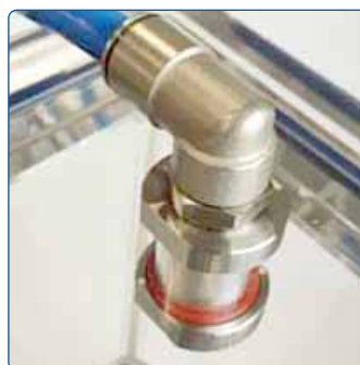
Chamber is well protected against mechanical stress