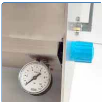
Vacuum level is simply set by regulator