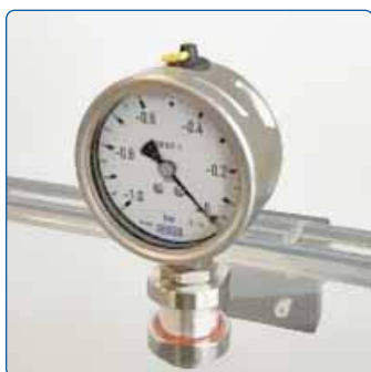
The vacuum chamber is designed for operation up to -0.8 bar