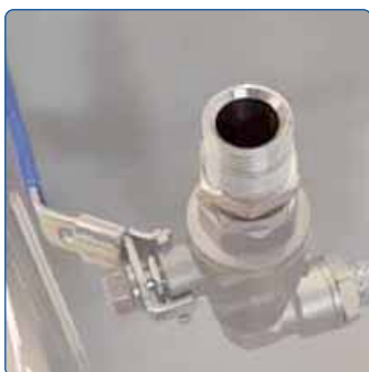
Water drains for easy tank maintenance